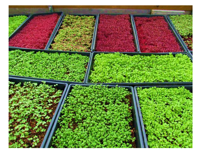
Besides selling produce that is more commonplace, crops such as microgreens can offer producers a special niche market with restaurants looking for unique, special ingredients.

growers that are a part of their menu, as well as which ingredients come from each farm. Featuring contributing growers adds a personal touch to the consumer's dining experience, which is just as important as the food since the cost to the consumer reaches beyond the plate.