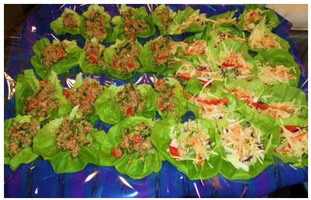
Restaurants are often looking for crops that can be used for turning the ordinary into something eye-catching, appealing, and tasty! A great example is hydroponicallygrown Bibb lettuce used as a sandwich "wrap".